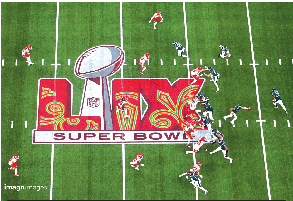
Philadelphia Eagles quarterback Jalen Hurts (1) fakes a hand off in the first quarter against the Kansas City Chiefs during Super Bowl LIX at Caesars Superdome.